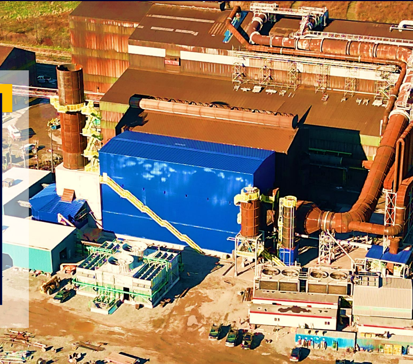
Welland plant, Canada

Equipped with activated carbon injection capabilities able to reduce melt shop fugitive emissions by 80%